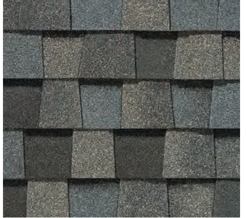
Max Def Burnt Sienna Max Def Dri